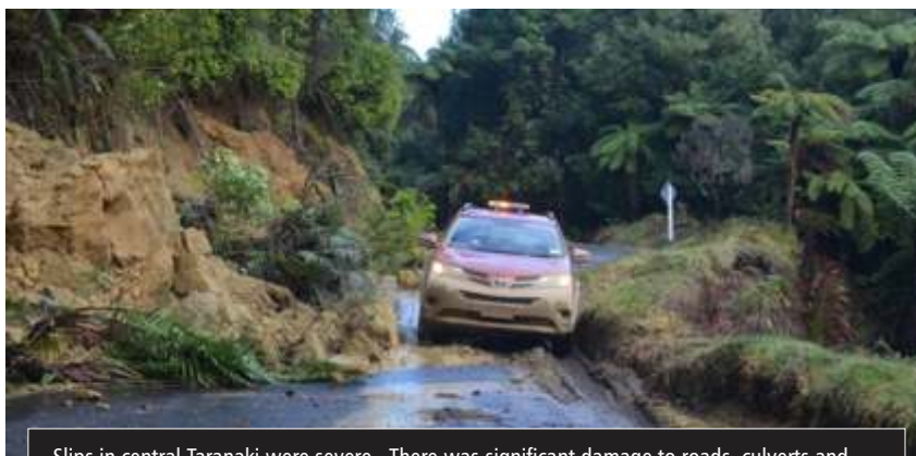
Slips in central Taranaki were severe. There was significant damage to roads, culverts and bridges in the eastern hill country. Some roads were blocked by as many as 35 slips, temporarily isolating some residents.

On Sunday 21 June, approximately 800 Taranaki residents were without power. The damage to the local roads severely hindered contractors' ability to access power restoration sites. Power poles and transformers were submerged under water and slips took out whole sections of lines. Large areas of farmland were flooded and/or affected by slips.