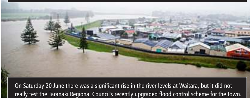
On Saturday 20 June there was a significant rise in the river levels at Waitara, but it did not really test the Taranaki Regional Council's recently upgraded flood control scheme for the town.