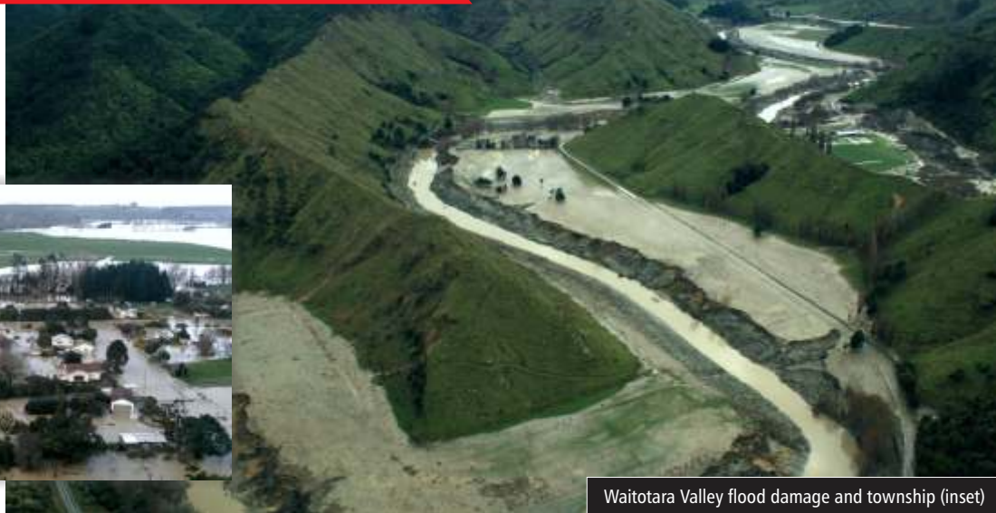
Waitotara Valley flood damage and township (inset)

Intense rainfall on Friday and Saturday 19 and 20 June resulted in widespread flooding, slips and severe disruptions to farmland and rural infrastructure, roading and electricity networks in rural Taranaki. Overall rainfall for the two day period was 150% of the total June average for Taranaki. The Taranaki Civil Defence & Emergency Management Emergency Operations Centre (EOC) was activated at approximately 10am on Saturday 20 June.