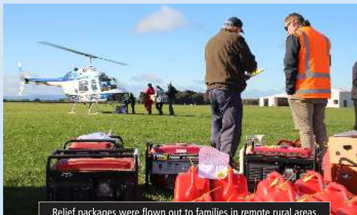
Relief packages were flown out to families in remote rural areas.

The Ministries for Primary Industries and Civil Defence have announced an additional $2.6 million of Government support which includes $1.28 million to help with rural infrastructure repair.